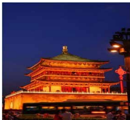
Drum Tower (Golou)

§ Department of Clinical Neuropsychopharmacology, Peking University Institute of Mental Health, Beijing, China