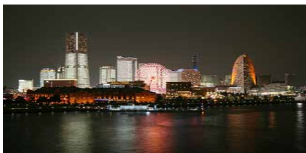
Two photos of the skyline of Yokohama, day and night