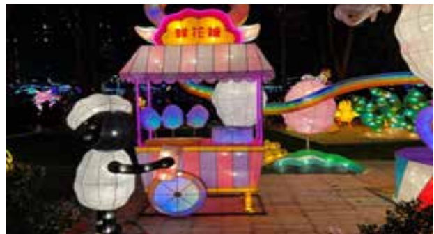
A Taipei lantern for reminiscence of collective childhood memory