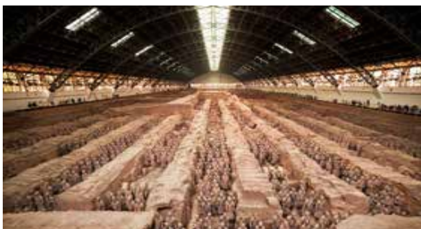
The Mausoleum of Qin Shihuang (Terra Cotta Warriors)

Xi'An, a fascinating historical city, is opening the warm arms to welcome participants from all over the world. We hope all participants will not only enjoy the pleasure of sharing the latest scientific knowledge but also enjoy your stay in Xi'An.