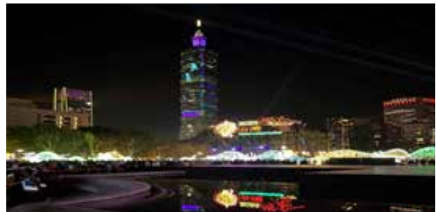
The main theme lantern in Taiwan Lantern Festival in Taipei, 2023

The TSOP spring meeting is an excellent opportunity for psychiatrist colleagues to gather together and enjoy the travel in the spring. We look forward to the participation of every TSOP member and would like to express our special thanks to the colleagues at Taipei City Psychiatric Center for their full support and enthusiastic help in organizing this meeting. (The author declares no conflicts of interest in reporting this feature.)