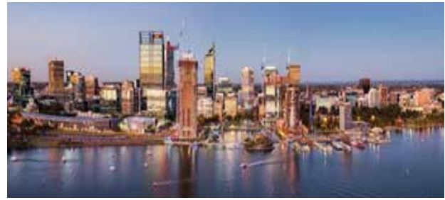
The skyline of Perth, the capital city of Western Australia

I look forward to welcoming colleagues from across the region. If unable to attend, we encourage you to join us for the virtual program. More information about the Congress is posted at www.congress.ranzcp.org . (The author declares no conflicts of interest in writing this announcement.)