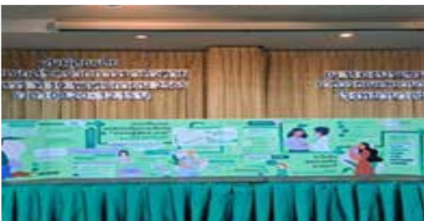
An exhibition on postpartum depression and maternal mental health

This annual event is organised for people deprived of their loved ones by suicide, in a come-together with multi-disciplinary personnel for healing and support. The event included special talks by the representatives of each organisation, an art therapy session by an art therapist, and a cognitive behavioural therapist. Participants also attended a group activity commemorating those loved ones. The activities were intended to promote self-recovery and support as well as to renew a sense of belonging after grieving. (The authors declare no conflicts of interest in writing this feature.)