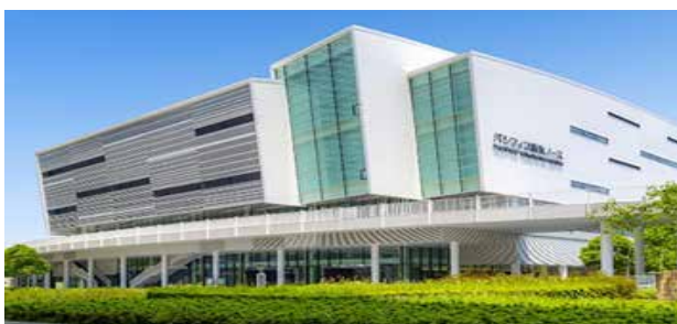
PACIFICO Yokohama North (Reprint permissions of three photos granted)

The 119th Annual Meeting of the Japanese Society of Psychiatry and Neurology will be held at PACIFICO Yokohama North from Thursday, 22 June to Saturday, 24 June, 2023. Built on “all in one” concept, PACIFICO Yokohama is one of the largest convention complexes in the world, equipped with all the functions required for any type of convention, such as meetings, incentive conventions, exhibitions and events.