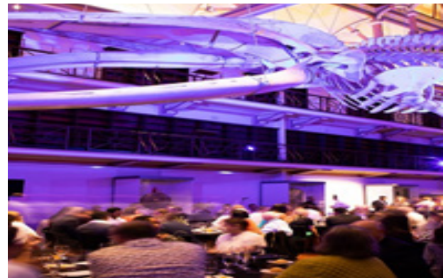
Photo 2. Gala dinner at the Western Australian Museum Boola Bardip.