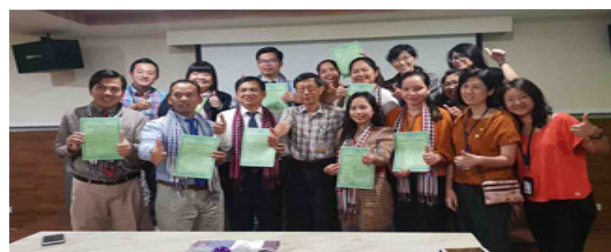
Photo 2. A 2018 KSPH photo of graduating trainees from Cambodia