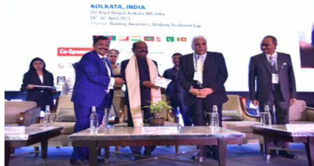
Photo 1. The inauguration ceremony of WPA RC 2023

The chief guest at the inauguration was His Excellency Honorable Governor of West Bengal Dr. C. V. Ananda Bose, IAS. At the ceremony, he complimented the WPA and SAARC Psychiatric Federation on the excellent work in mental health services and presented a scroll of honour for their services.