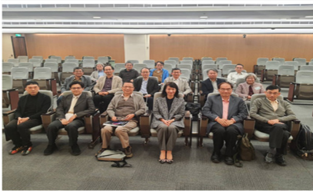
Photo 1. A photo taken at the executive council meeting after 2023