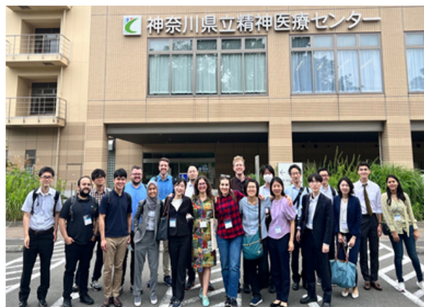
Photo 1. A photo of the tour to visit Kanagawa Psychiatric Medical Center in Shingawa Prefecture

The JYPO, through initiatives with the conference, offering plans to other organizations, and not only within its organisation, is contributing to the development of leadership in young psychiatrists, cultivation of international perspectives, and contribution to community mental health. We sincerely hope that you will continue to pay attention to our activities. (The author declares no conflicts of interest in writing this report.)