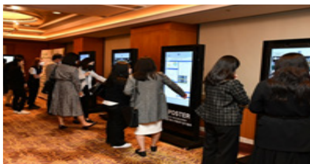
Photo 1. e-Poster presentation at the spring congress of the KNPA

More than 1,600 psychiatrists in Korea registered, and around 1,000 psychiatrists attended the congress in person per day during the two-day congress. We had 2 plenary lectures, 4 special lectures, 24 symposia, 2 CME sessions and 4 workshops in 7 rooms. Also 90 e-posters (Photo 1) and 10 oral presentations were presented.