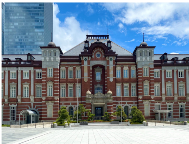
A photo of Tokyo Station

Welcome to Tokyo CINP2024, 23-24 May. Please visit for programme information and updates at websites