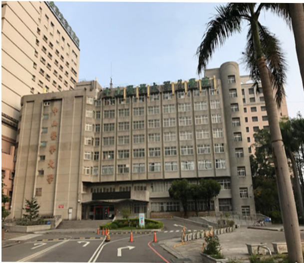
Photo 1. The venue building, Jengshin Hall, on campus of Chung Shan Medical University

Mental Health Act and the evolving landscape of medical technology will be the crucial points of focus for discussion. The final programmes are not yet finalized from the submitted presenters at the press time. But the 2023 TSOP annual meeting will have symposia, workshops, plenary lectures, a special lecture, forums, industry-sponsored lectures, and poster presentations. (The author declares no conflicts of interest in writing this announcement.)