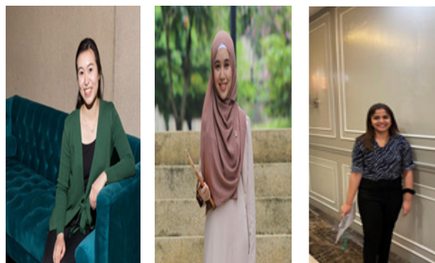
Photo 1. Three separated photos of the awardees