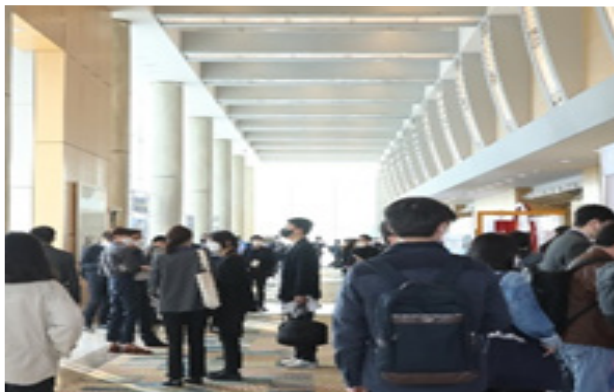
KNPA members participating in the annual spring congress

Totally, 1,374 participants gathered together with joy and exchanged opinions. Winners were invited to present at this congress as well as receiving a memento of their academic achievement.