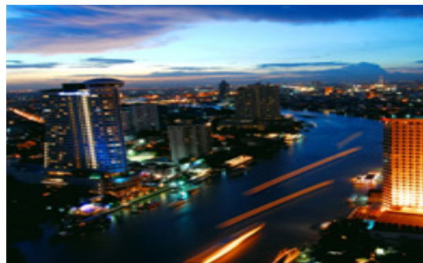
Bangkok night along the Chao Phraya River

We look forward to welcoming everyone to Thailand. (The authors declare no conflicts of interest in announcing this news.)