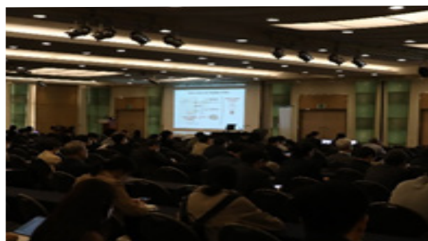
KNPA audience listening to a plenary lecture