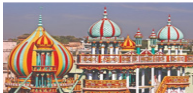
Chandanpura Masjid, a famous landmark in Chattogram renowned for its impressive architecture with multiple domes and steeples painted in bright colors.

We look forward to welcoming you all and having a wonderful interaction in Chattogram, Bangladesh. (The author declares no potential conflicts of interest besides promoting the attendance).