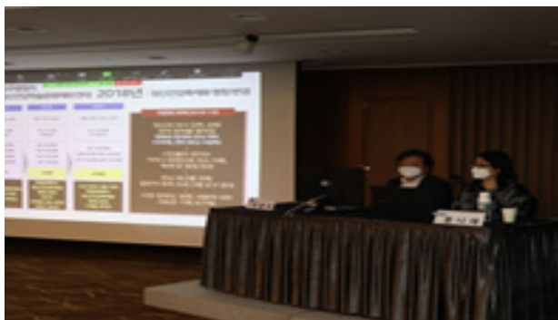
A photo of a symposium during the fall congress in Busan

Numerous symposia were prepared to introduce and draw dynamic discussion on "Current research state on developing digital therapeutics" and "The development and validation of advanced convergence medical technologies in the field of psychiatry."