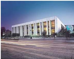
Exterior view of Megaron, Athens