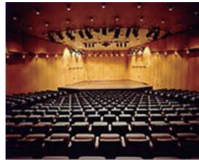
Interior of Dimitri Mitropoulos Hall, Megaron, Athens

Calls for abstracts for free communication, young scientist awards, and poster are open until 10 December, 2014. During the 12th WFSBP Congress in Athens, worldwide opinion leaders will share with us the recent innovations in their respective fields which impact on diagnosis, treatment and quality of life of our patients. High scientific level sessions will be organised including plenary lectures, symposia, interactive workshops and debates. I hope many Asian colleagues will join the 12th WFSBP Congress in Athens.